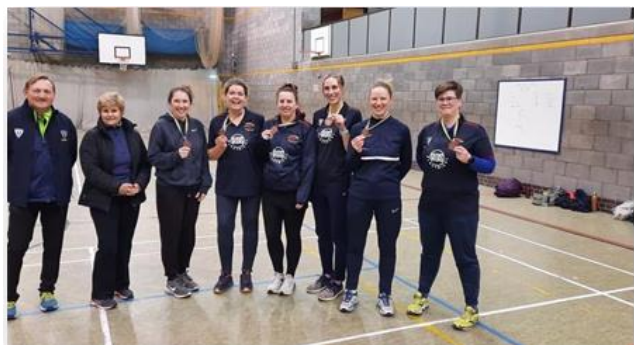
Women & Girls Club of the Year